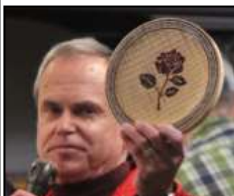
Roger Crooks ~ stone