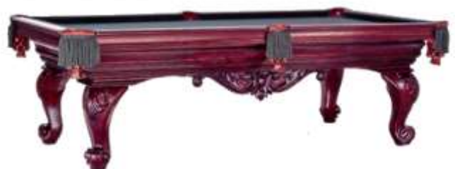
Marquee ~ Designer Series