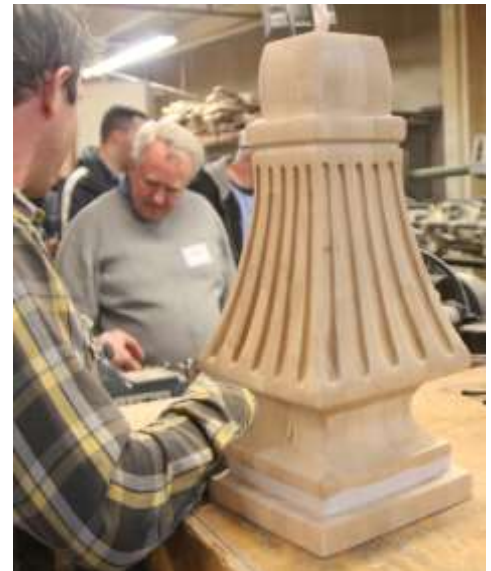
Some people just make legs

They make tables in a variety of formats, from Classic and Legendary to Modern. Prices cover a fairly wide range.