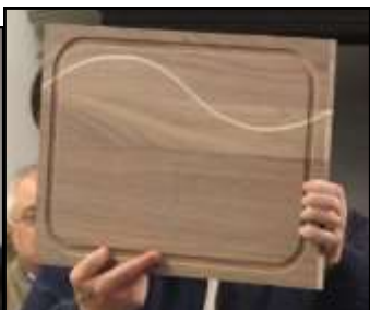
Tom ~ breadboards