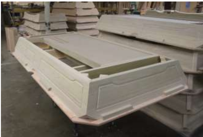
Beautiful casework, stacked everywhere

thing for hours. It's a tedious process but at the end of a day's work they have sixteen legs, four tables worth. Very ornate.