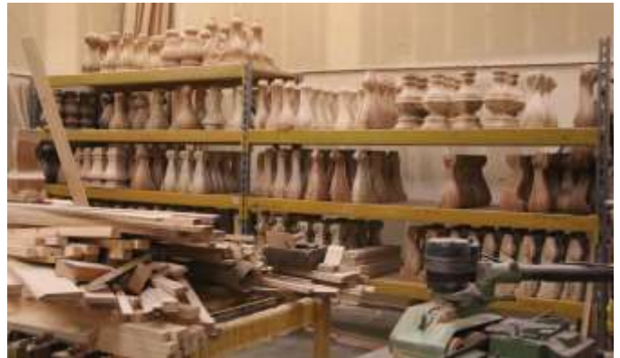
Many legs of may different designs