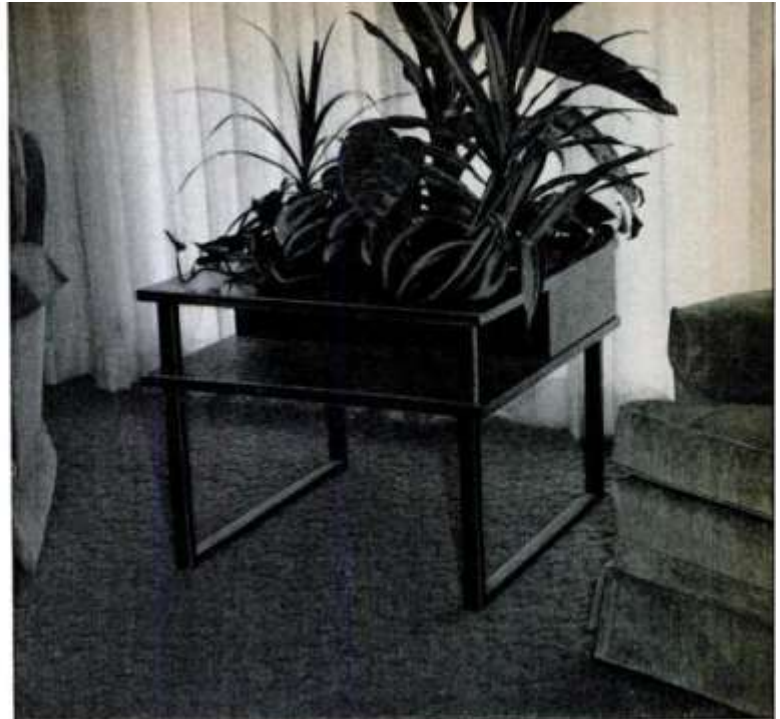
Table is most at home near window where plants get plenty of light.

Gloss-enamel finish requires careful sanding. Apply at least three base coats of enamel. Let each coat dry overnight, and sand between coats with 220 paper on a block. Before the final coat, wet-sand with 320 waterproof paper.— The Editors