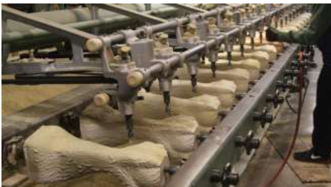
Leg duplicating machine