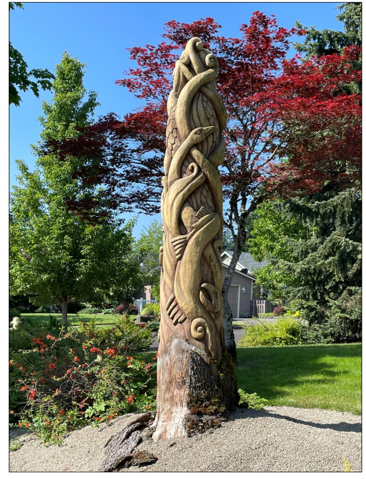
Editor's Note: Check out this amazing pole in the neighborhood. Lose a tree but gain a totem pole.

MAC is a department of Portland Parks & Recreation.