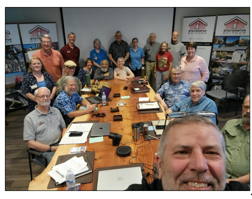
The Day-long Planning Group meets. See <u>page 3</u> for details